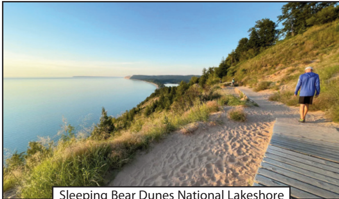
Sleeping Bear Dunes National Lakeshore