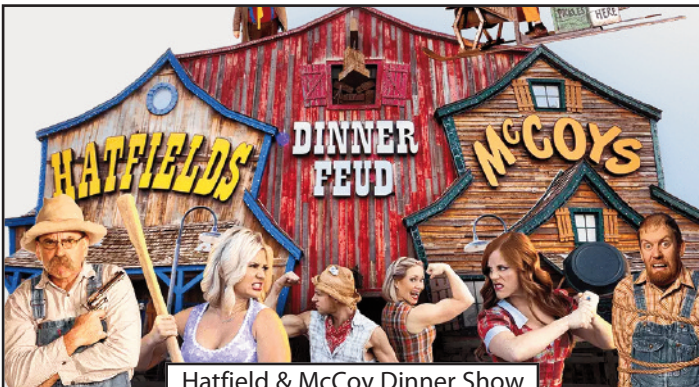
Hatfield & McCoy Dinner Show