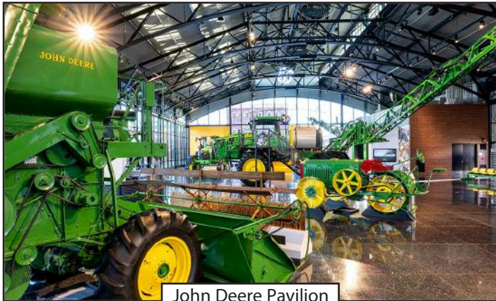
John Deere Pavilion