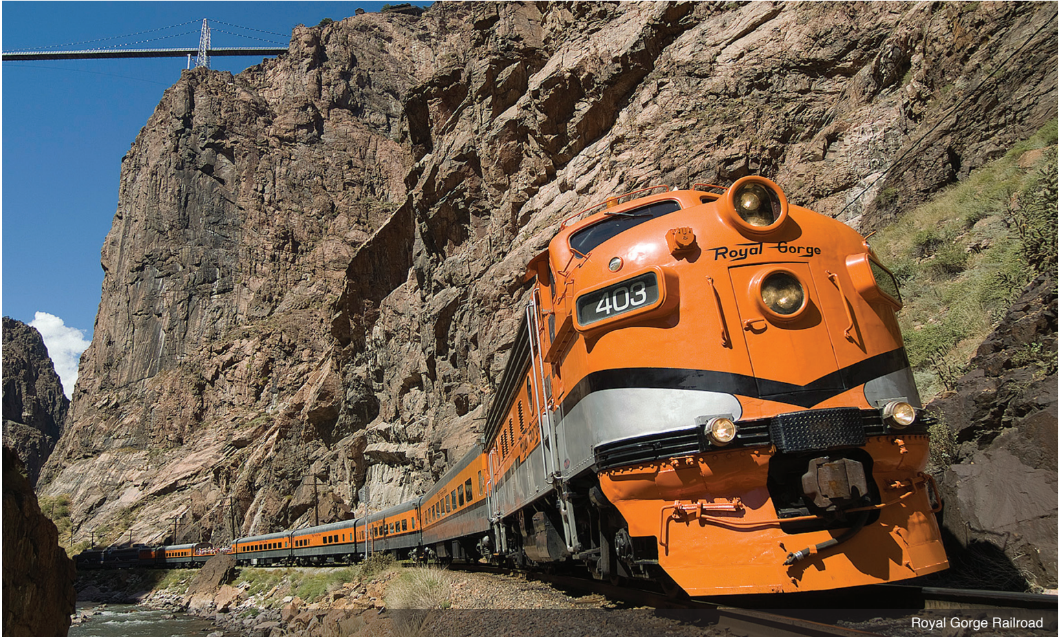
Royal Gorge Railroad